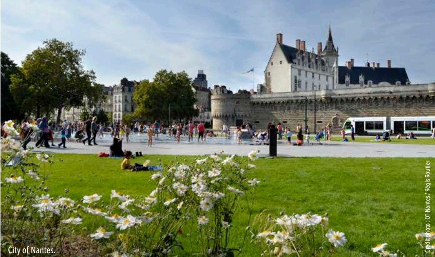
City of Nantes.